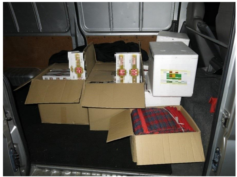
Duty-unpaid cigarettes seized from van in Simei Street 1