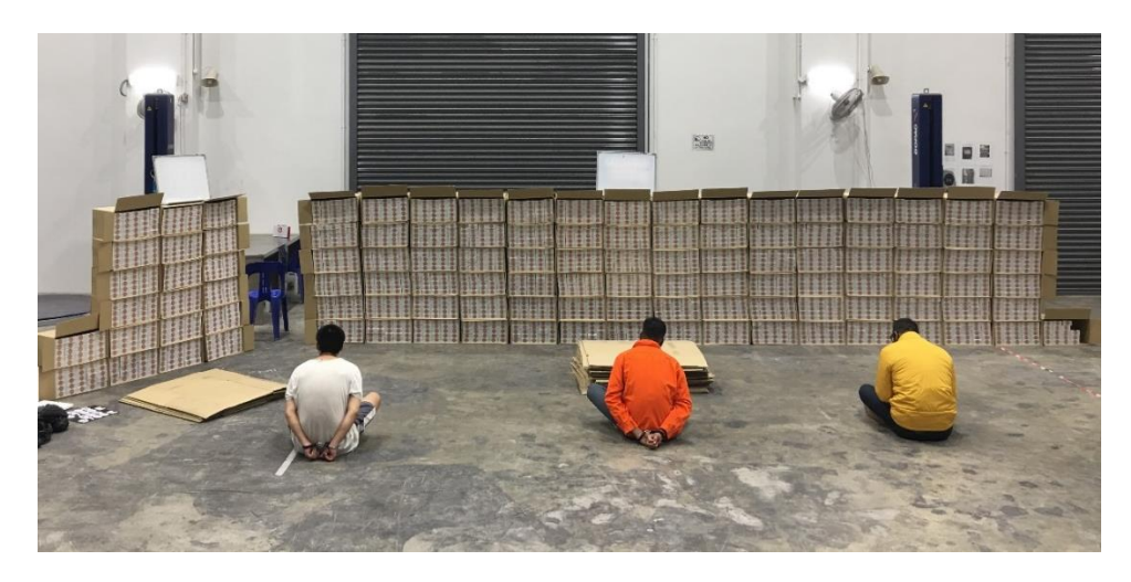
2,768 cartons of duty-unpaid cigarettes seized and three men arrested