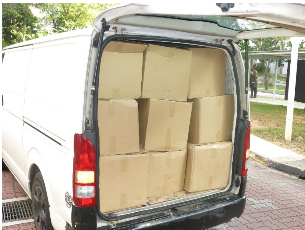
Duty-unpaid cigarettes seized from van in Woodlands Circle