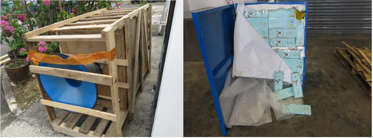
Duty-unpaid cigarettes found concealed in an air purifier unit that was sent to Realty Park.