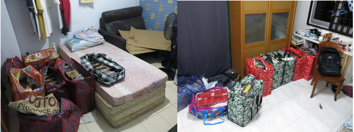
Duty-unpaid cigarettes seized from two HDB units at King George's Avenue and Serangoon North Avenue 4.