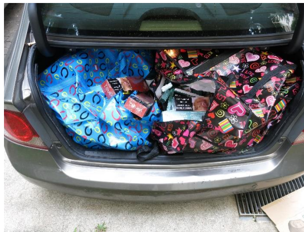
Vehicle used for storage and delivery of duty-unpaid cigarettes at Yishun Ring Road.