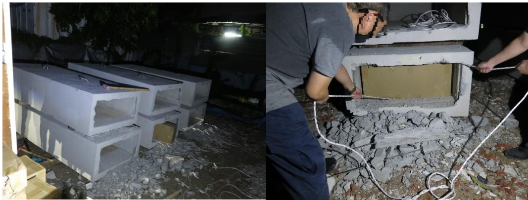
Duty-unpaid cigarettes concealed in the hollow compartment of the concrete slabs.