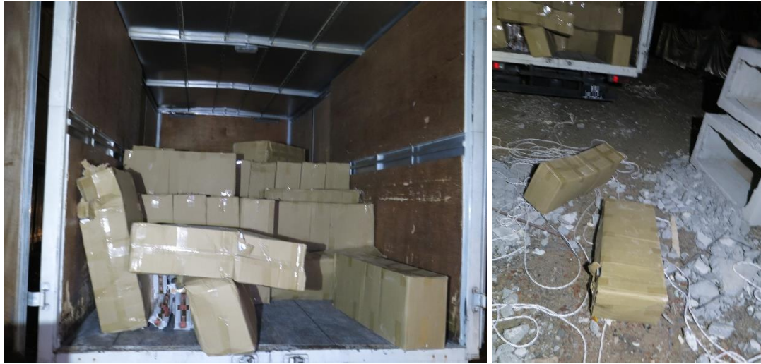
The Singapore-registered truck (left) and concrete slabs containing carton boxes of duty-unpaid cigarettes (right) found at a storage yard at Penjuru Walk.