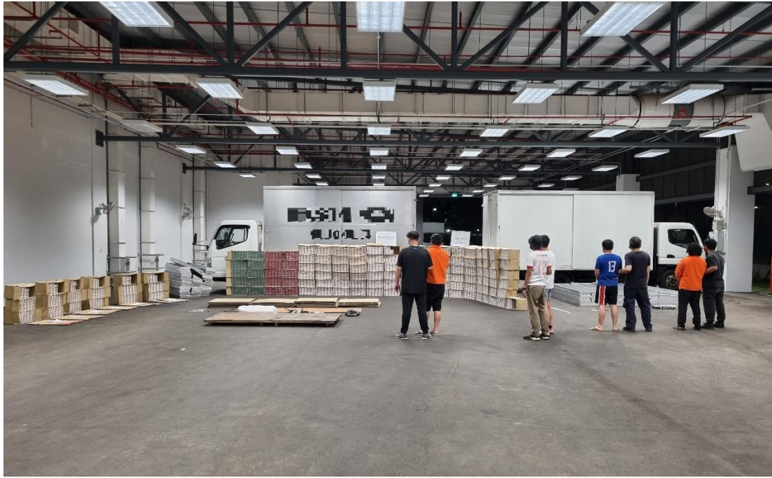
Four men arrested and two Singapore-registered trucks and 2,982 cartons of duty-unpaid cigarettes were seized during the operation.