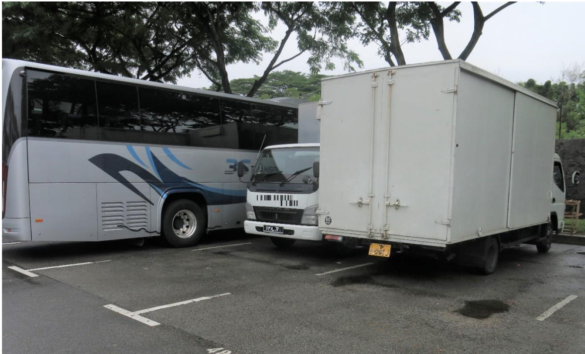
The two Singapore-registered trucks parked next to each other.